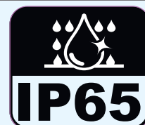
IP65 MOTOR for all powers