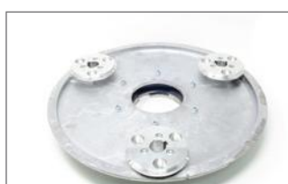
Fix Plate A3