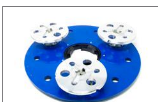
Multidisc 3 Head