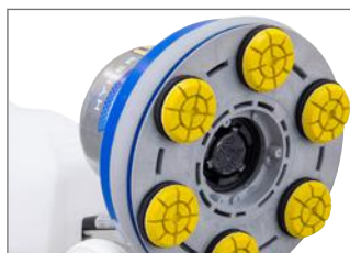
Piatto 6 Attachi Velcro