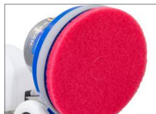
Abrasive floor pads