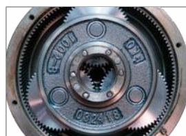
HD TRANSMISSION CROWN in Steel SATELLITE in Steel SOLAR in Steel