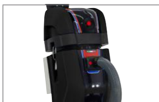
On Board Vacuum Kit