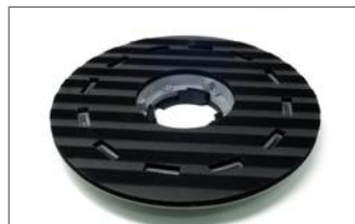
Pad Holder PADS