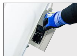
Schuko socket as standard for the 4HP version