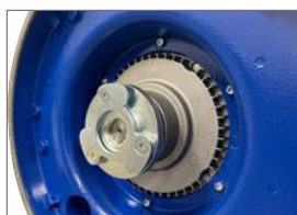
Accessory flange W-type CLUTCH