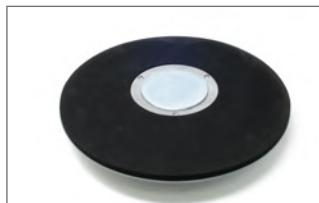
Pad Holder Sand Paper