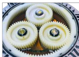
SILENT TRANSMISSION CROWN : Polymer SATELLITE : Polymer SOLAR : Steel