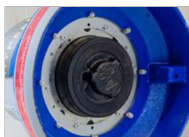
Robust metal flange HD connection.