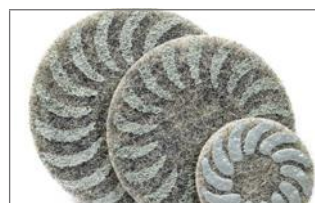
Spiral diamond pads